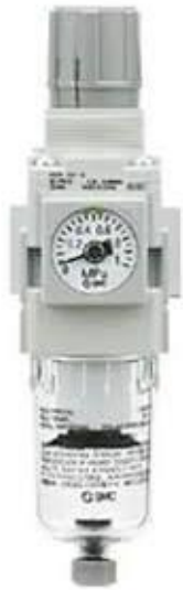
The compact AW series filter/regulator by SMC

Particle content and most liquid water or oil can be easily removed using a general-purpose particle filter. These filters typically use a cylindrical non-woven fabric filter element to reject particles larger than 5 \mu\text{m} in diameter, sufficient to meet our class 5 particle purity requirement. The filter element is usually placed within a "bowl" into which supplied air flows through a spiral shaped vane. This creates a vortex within the bowl which centrifugally separates liquid water condensate and liquid oil from the air stream and collects it at the bottom of the bowl where it can be extracted through a drain.